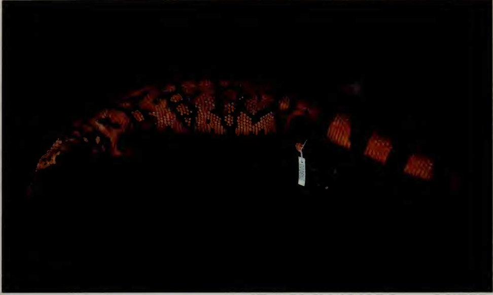
Fig. 9. Gila monster from Clark Mountain, San Bernardino County, California. Marjorie Barrick Museum of Natural History, University of Nevada, Las Vegas #R665.

area. The individual that discovered the animal was familiar with Gila monsters and was certain of the identity of the specimen. No photographs were taken. The relatively populated nature of the area to the west of this locale suggests the possibility that the specimen was a released captive. Furthermore, the area appears to be atypical of habitats where other Gila monsters have been observed in California (with the possible exception of the Colorado Desert records near Blythe and Desert Center), casting some doubt on the probability that it was indigenous.